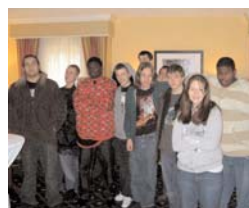
Hellam Campus students pose in the presidential suite (above) and in front of the Gateway Cinema (right).