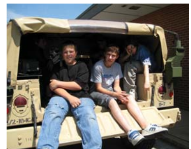
Spring Grove students got a first hand look at an Army National Guard Humvee in May.