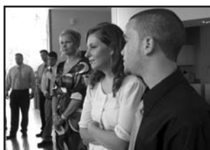
Graduates line up in lobby before the ceremony begins